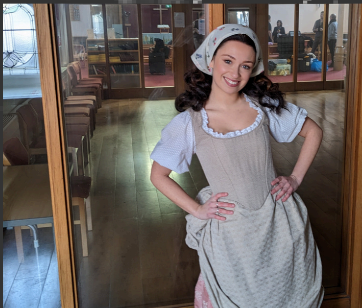
'CHORUS' IN L'ELISIR D'AMORE