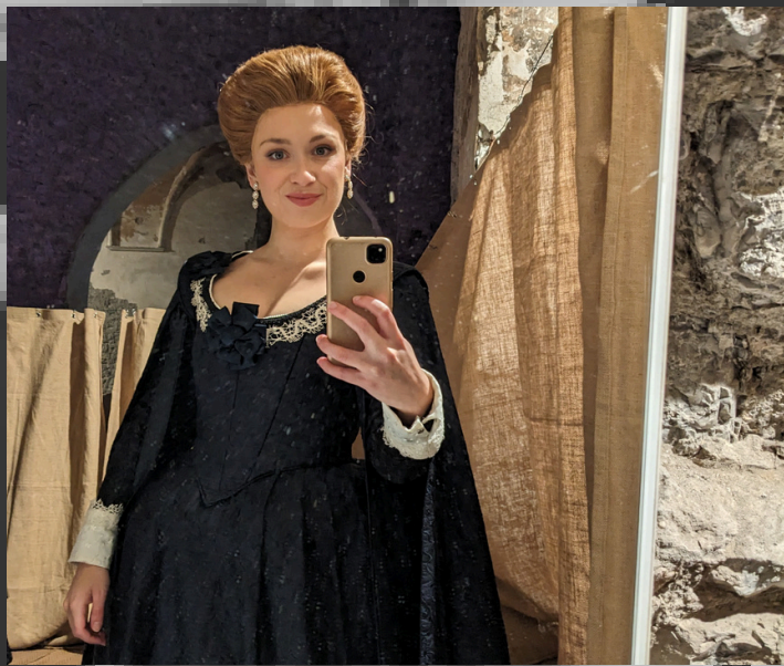
COUNTESS CEPRANO IN 'RIGOLETTO'