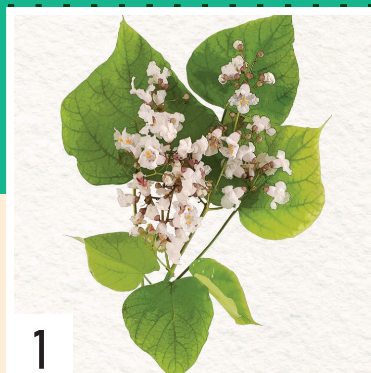
1 INDIAN BEAN TREE Catalpa bignonioides