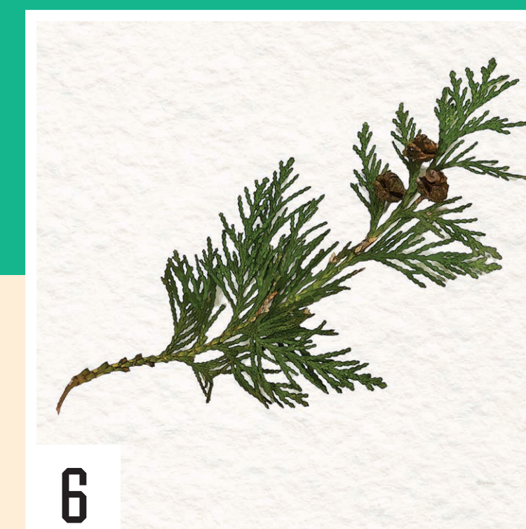
6 WESTERN RED CEDAR Thuja plicata