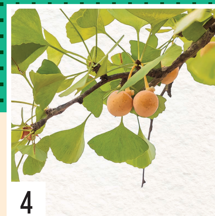
4 MAIDENHAIR TREE Ginkgo biloba