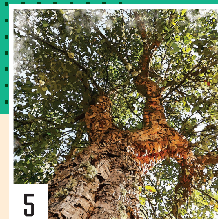
5 CORK OAK Quercus suber