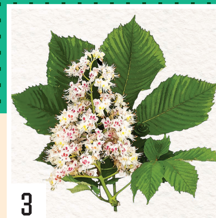
3 INDIAN HORSE CHESTNUT Ascelus indica