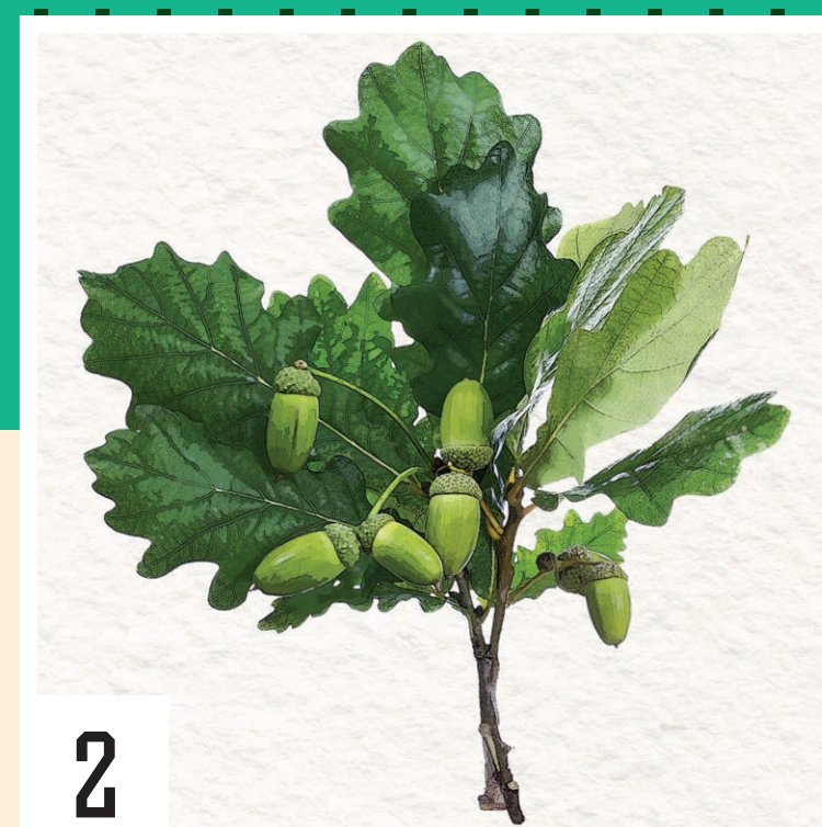
2 ENGLISH OAK Quercus robur